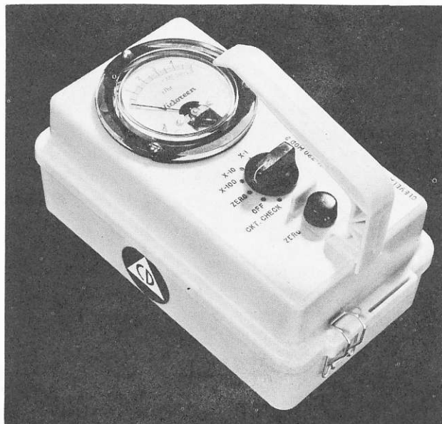
FIGURE 3.—CD V-720, high-range beta-gamma survey meter.

The CD V-720 (figure 3) is a high-range beta-gamma survey meter designed for special postattack