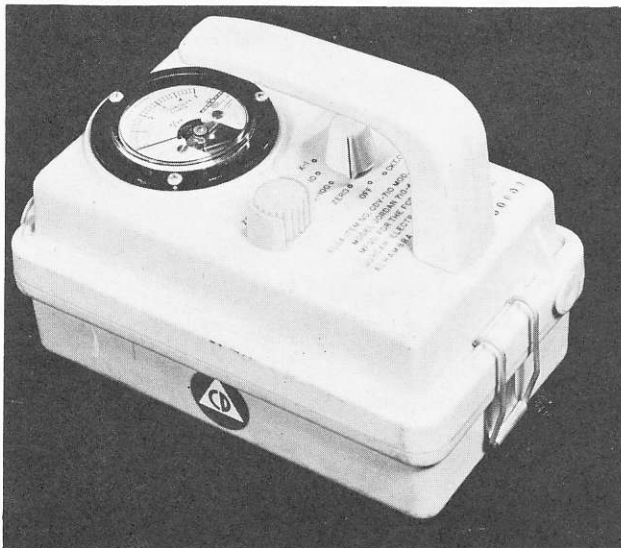
FIGURE 2.—CD V-710, medium-range gamma survey meter.

The CD V-710 (fig. 2) is a medium-range gamma survey meter for general postattack operational use. The ranges of this instrument are 0-0.5, 0-5, and