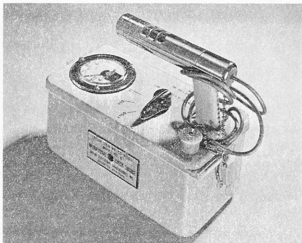
FIGURE 1.—CD V-700, low-range beta-gamma survey meter.

The CD V-700 radiation survey meter (fig. 1) is a highly sensitive low-range instrument that can